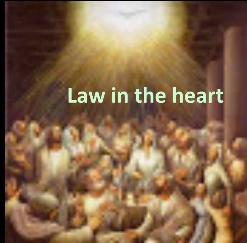
Day of Pentecost